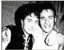
BOSS . . . with Bruce Springsteen

success that many working-class writers can only dream of. He says: "There's less social mobility in general these days."