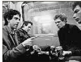
FAIR POINT . . . grilling The Clash

Despite coming from a modest background, Tony has achieved